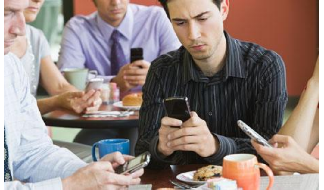
Young people using smartphones