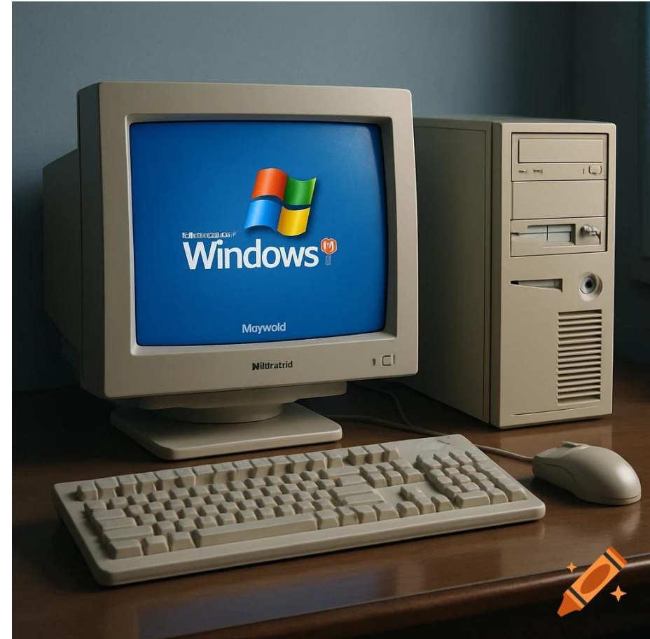
Microsoft Windows Computer